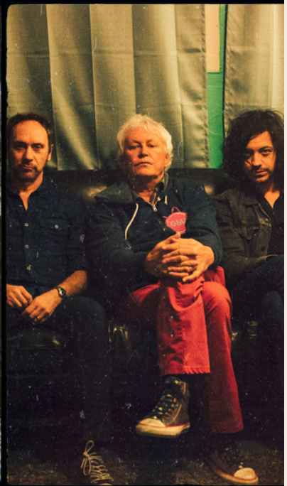
GUIDED BY VOICES